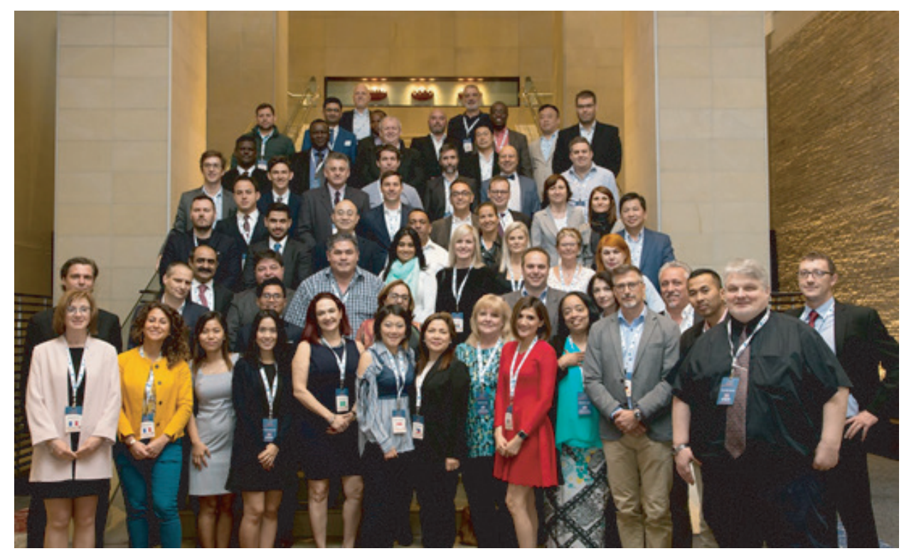
More photos from the event!